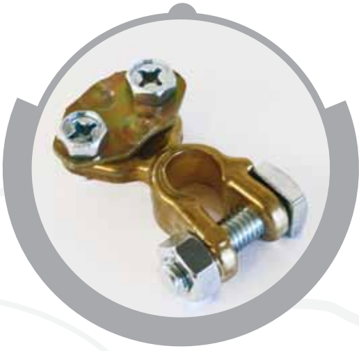
KTBT10J UNIVERSAL SADDLE TYPE SUITS SMALL JAPANESE BATTERY POSTS SUITS CABLE 32MM 2