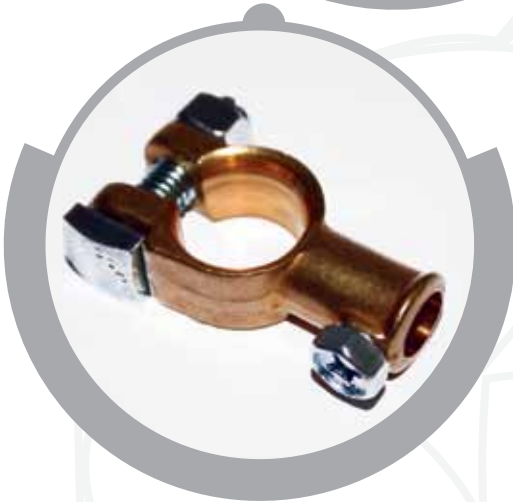
KTBT22 UNIVERSAL END ENTRY SCREW OR SOLDER TYPE SUITS CABLE 32MM 2

NOTE: Range also available in retail display stand stacks.