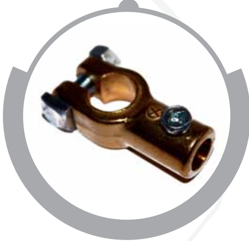
KTBT14P - KTBT14N NEGATIVE OR POSITIVE END ENTRY HEAVY DUTY, SCREW TYPE SUITS CABLE 70MM 2