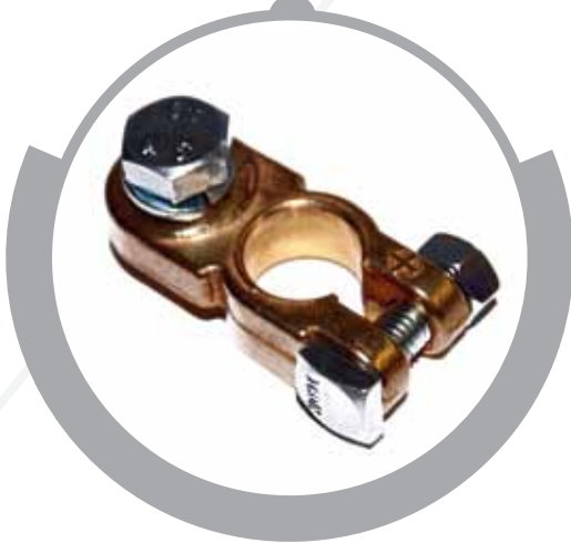
KTBT19P - KTBT19N NEGATIVE OR POSITIVE, HEAVY DUTY 10MM BOLT STEEL BOLT