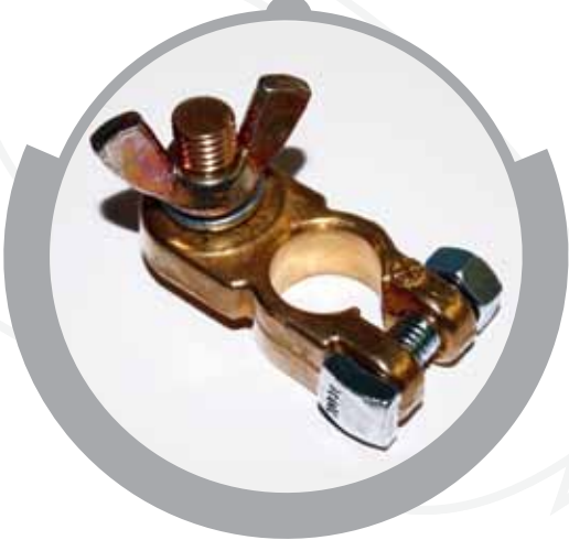
KTBT18P - KTBT18N NEGATIVE OR POSITIVE, WING NUT HEAVY DUTY 10MM STUD STEEL WING NUT