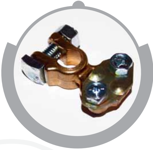
KTBT10 UNIVERSAL SADDLE TYPE SUITS CABLE 32MM 2