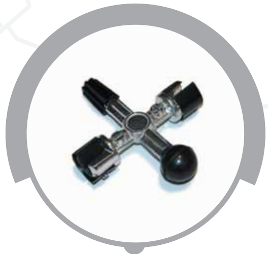
KTBTA003 PROFESSIONAL 4 WAY BATTERY POST AND TERMINAL CLEANER