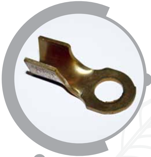
KTBT21 UNIVERSAL END CRIMP OR SOLDER PRESSED BRASS, 10MM HOLE SUITS CABLE 32MM 2

NOTE: Range also available in retail display stand stacks.