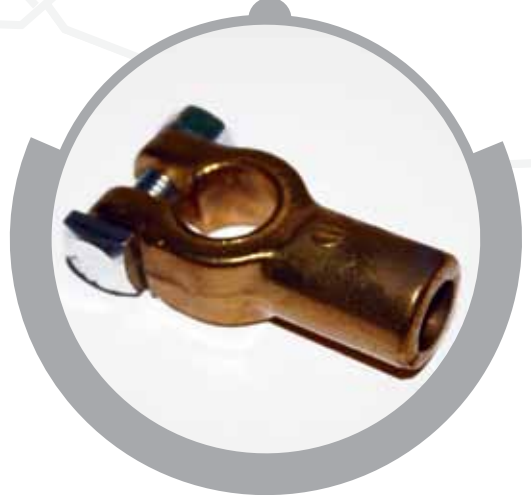
KTBT08P - KTBT08N NEGATIVE OR POSITIVE END ENTRY HEAVY DUTY, SOLDER TYPE SUITS CABLE 70MM 2