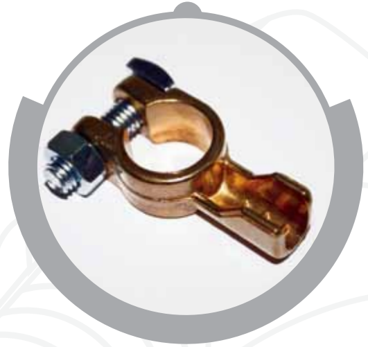
KTBT02 UNIVERSAL END CRIMP OR SOLDER SUITS CABLE 32MM 2