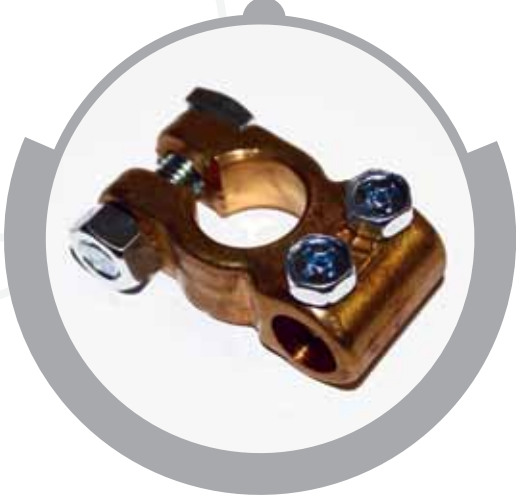
KTBT12P - KTBT12N NEGATIVE OR POSITIVE SIDE ENTRY HEAVY DUTY, SCREW TYPE SUITS CABLE 70MM 2