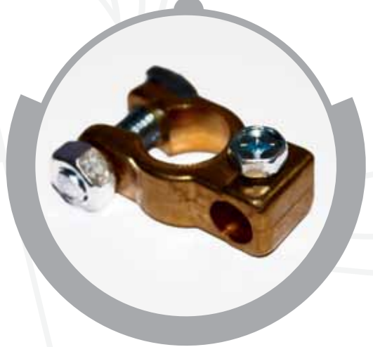
KTBT05 UNIVERSAL SIDE ENTRY SCREW OR SOLDER TYPE SUITS CABLE 32MM 2