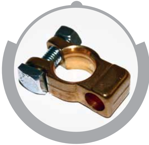
KTBT01 UNIVERSAL SIDE ENTRY SOLDER TYPE SUITS CABLE 32MM 2

KT battery terminals are made from forged brass which is machined from a solid brass bar that delivers up to 40% better electrical conductivity and longer lasting performance.