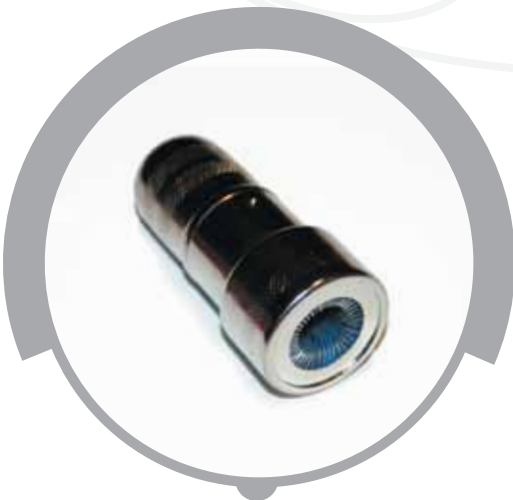
KTBTA001 BATTERY POST CLEANER METAL CASE NICKEL PLATED