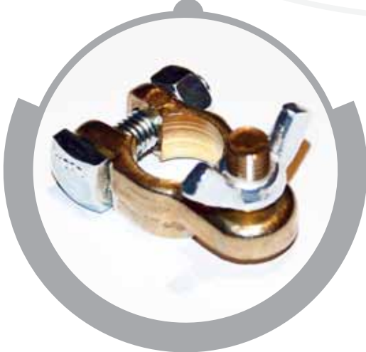
KTBT06 UNIVERSAL WING NUT 8MM STUD STEEL WING NUT NOTE: ALSO AVAILABLE IN NEGATIVE OR POSITIVE MARKING