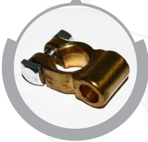
KTBT03P - KTBT03N NEGATIVE OR POSITIVE SIDE ENTRY HEAVY DUTY, SOLDER TYPE SUITS CABLE 32MM 2