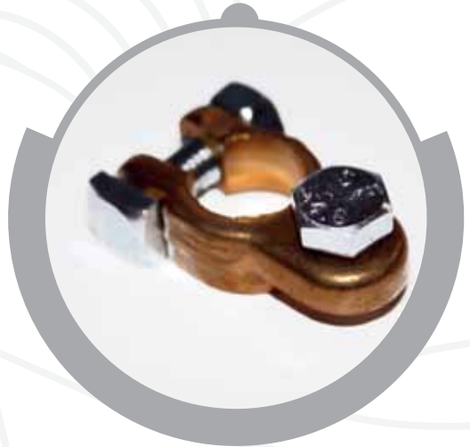
KTBT23 UNIVERSAL BOLT TYPE 8MM STEEL BOLT