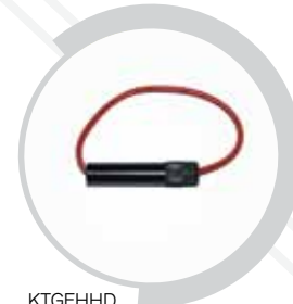
KTGFHHD HEAVY DUTY GLASS FUSE HOLDER MATERIAL: BAKELITE CABLE LENGTH: 203MM CABLE: 6MM 2