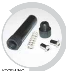
KTGFH/NO GLASS FUSE HOLDER MATERIAL: BAKELITE