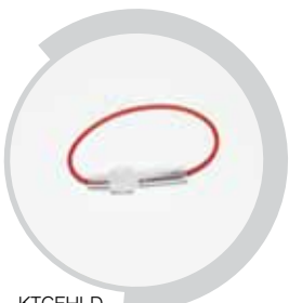
KTGFHLD LIGHT DUTY GLASS FUSE HOLDER MATERIAL: P.P CABLE LENGTH: 203MM CABLE: 3MM 2